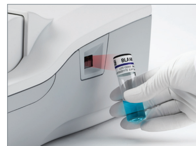
3. Scan calibration solutions.