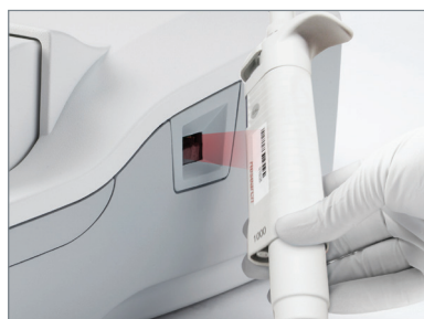
2. Scan pipette