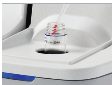
4. Dispense samples.